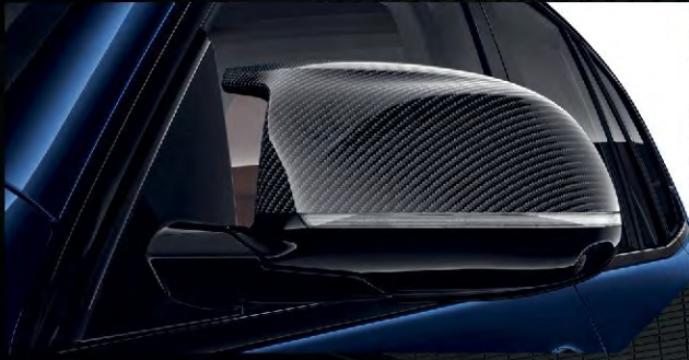
B51168077001 B51168077002 Outside mirror shroud. Carbon. left/right AED 3,873 each