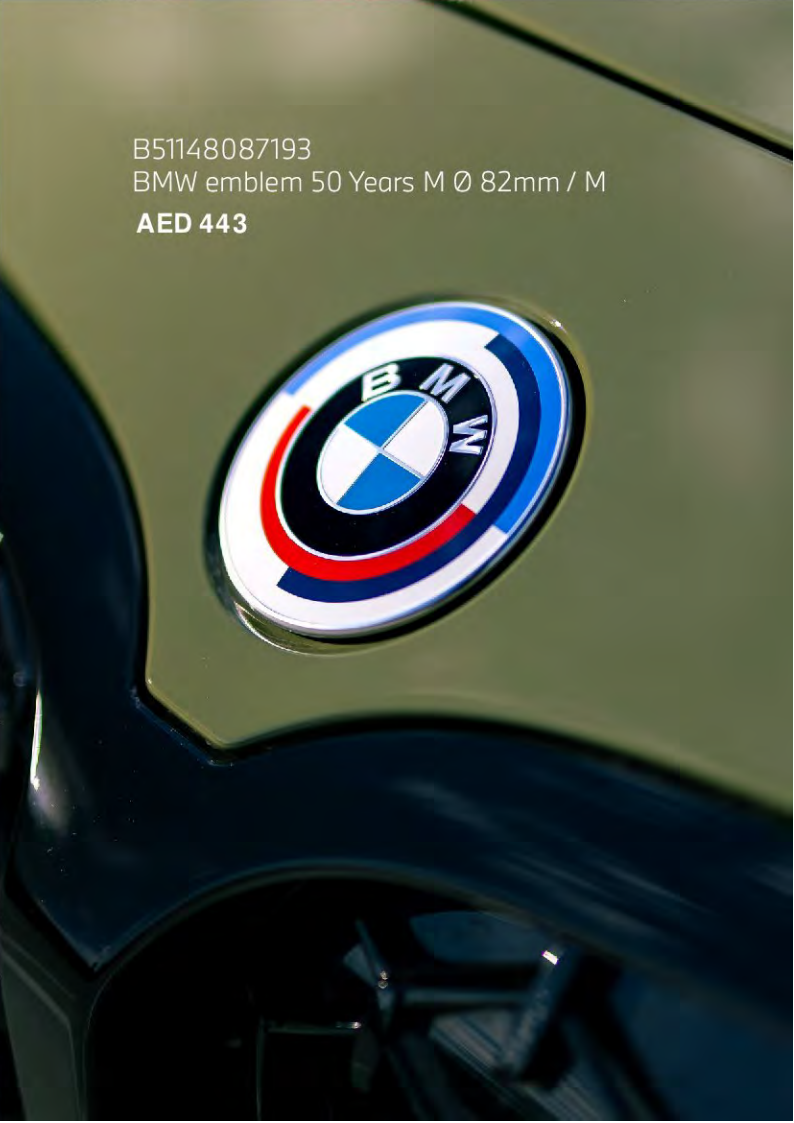
B51148087193 BMW emblem 50 Years M Ø 82mm / M AED 443