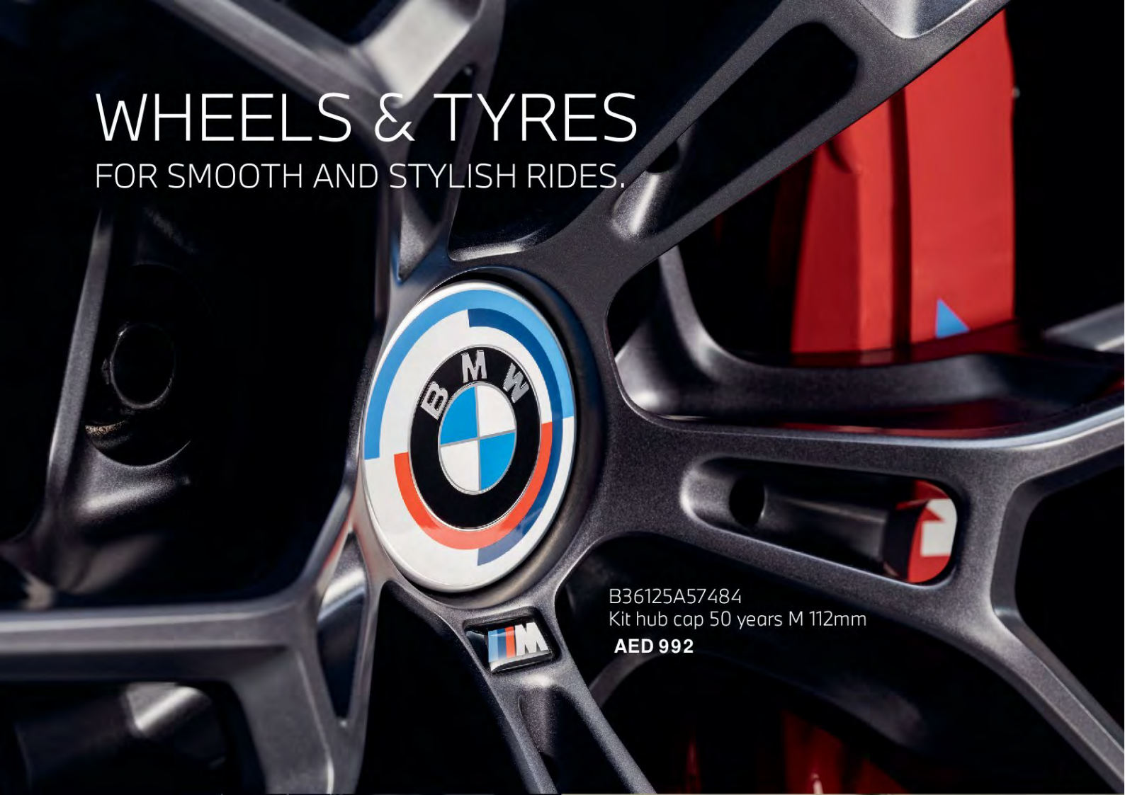
B36125A57484 Kit hub cap 50 years M 112mm AED 992