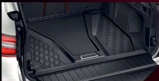
B51472458568 Fitted luggage compartment mat SA418 AED 1,263