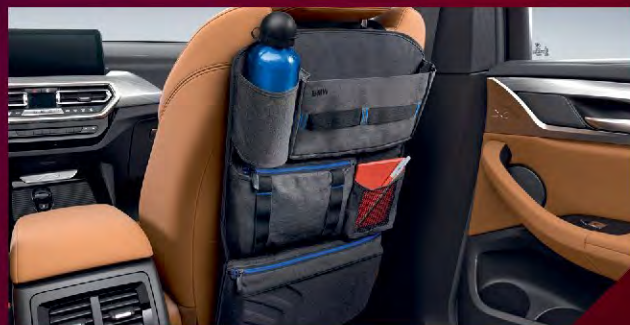
B52122406212 Seat-back storage pocket AED 687