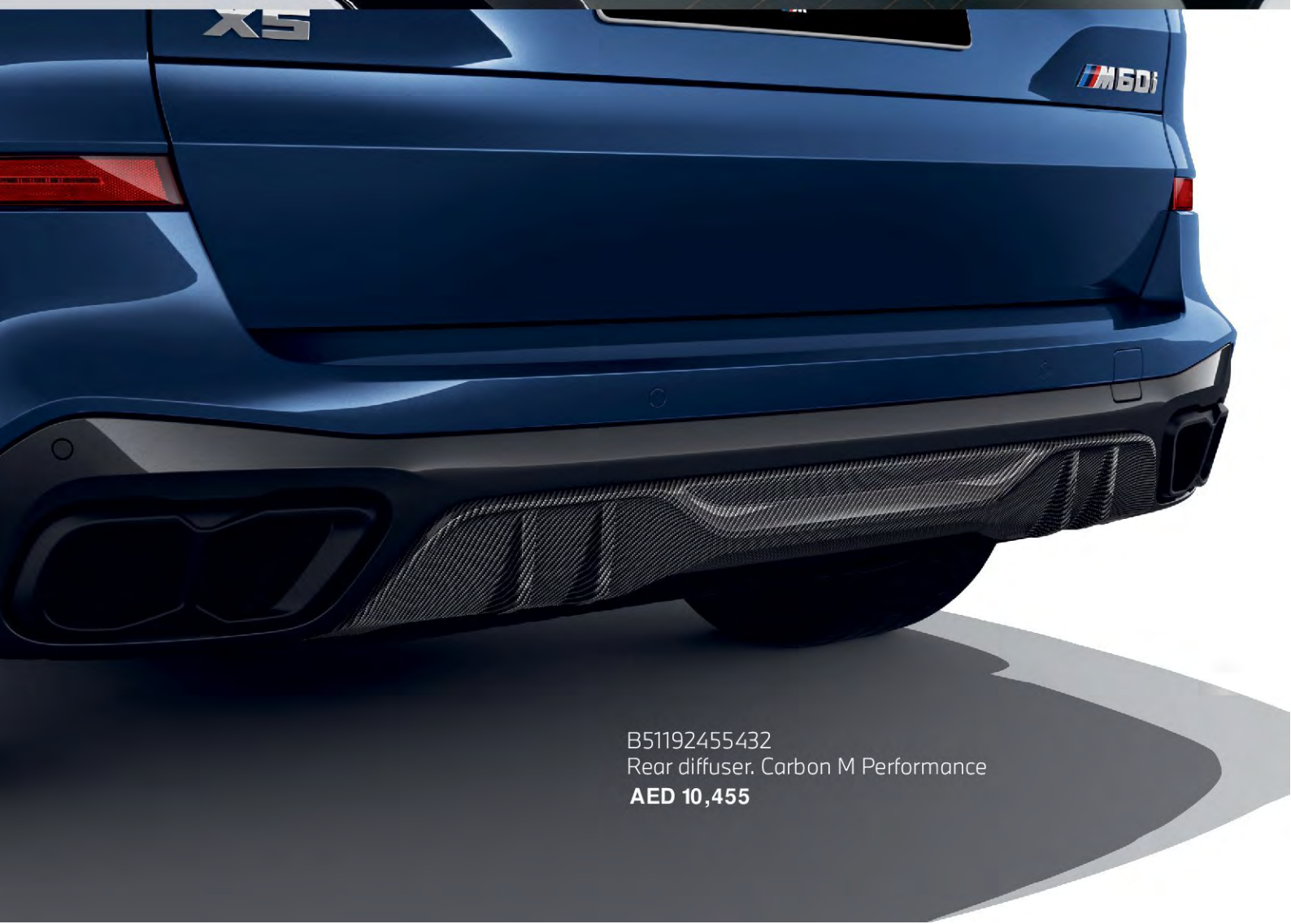
B51192455432 Rear diffuser. Carbon M Performance AED 10,455