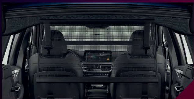
B51479410838 Boot/trunk floor net gross AED 455