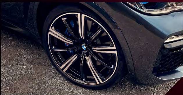
B36115A6C3F1 TPM wheel w/tire set summer black matte AED 38,662