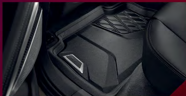
B51472458552 Floor mats. all-weather. rear AED 495