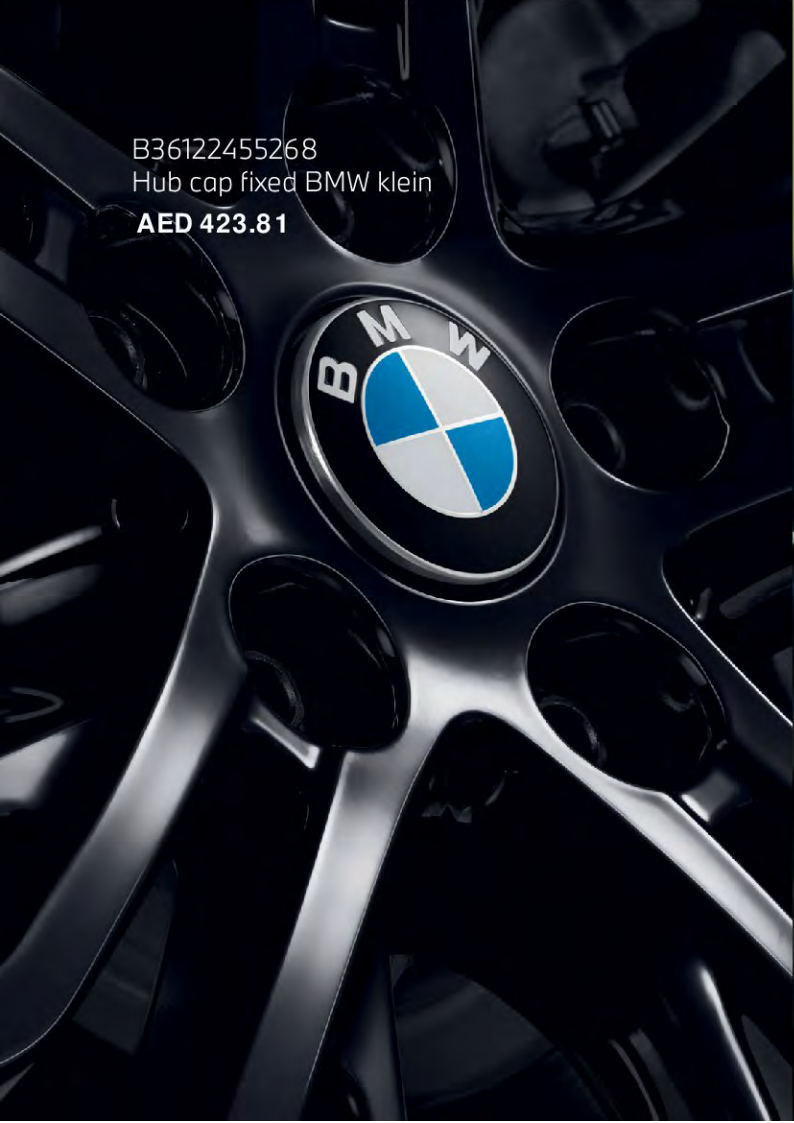
B36122455268 Hub cap fixed BMW klein AED 423.81