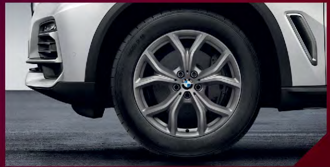
B36115A818D3 RDC Komplettradsatz Sommer Orbitgrey AED 34,635