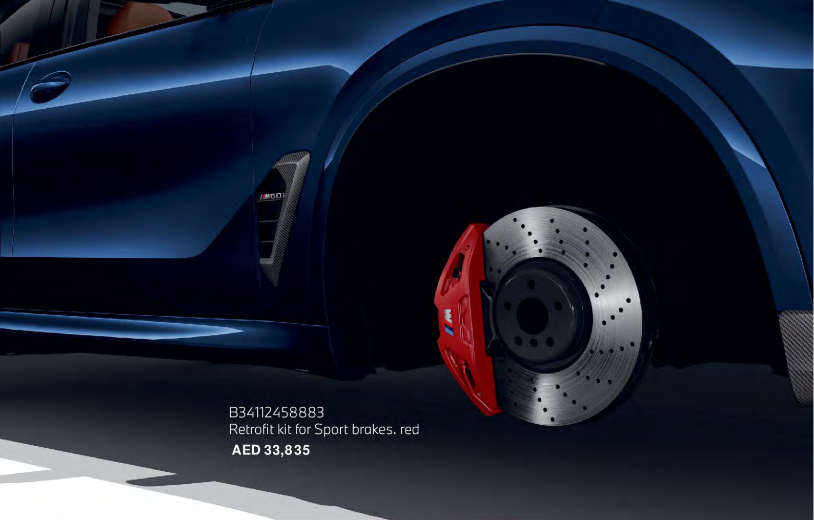
B34112458883 Retrofit kit for Sport brakes. red AED 33,835