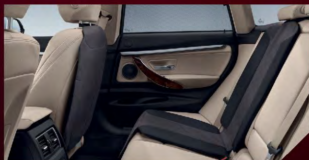
B82122448367 Backrest cover and child restraint base AED 596