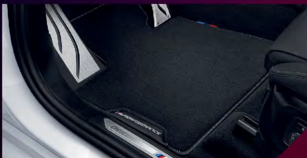
B51472457268 Floor mats M Performance LHD AED 2,482