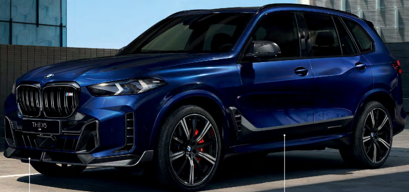
B51115B31407 B51115B31408 Front splitter CFRP left/right M Performance AED 8,454 each