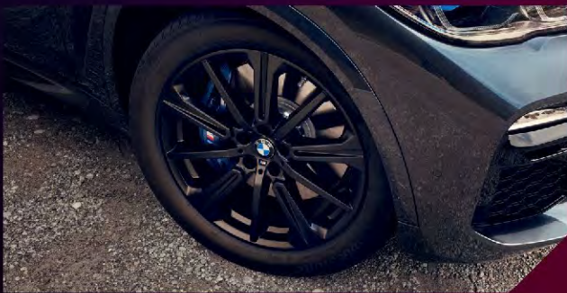
B36115A818D4 RDC Komplettradsatz Sommer Jet Black AED 38,876