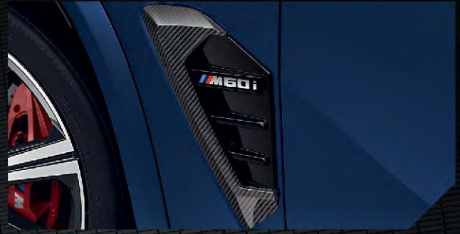
B51135A3E057 B51135A3E058 Ornamental grille side Carbon left/right AED 2,625 each