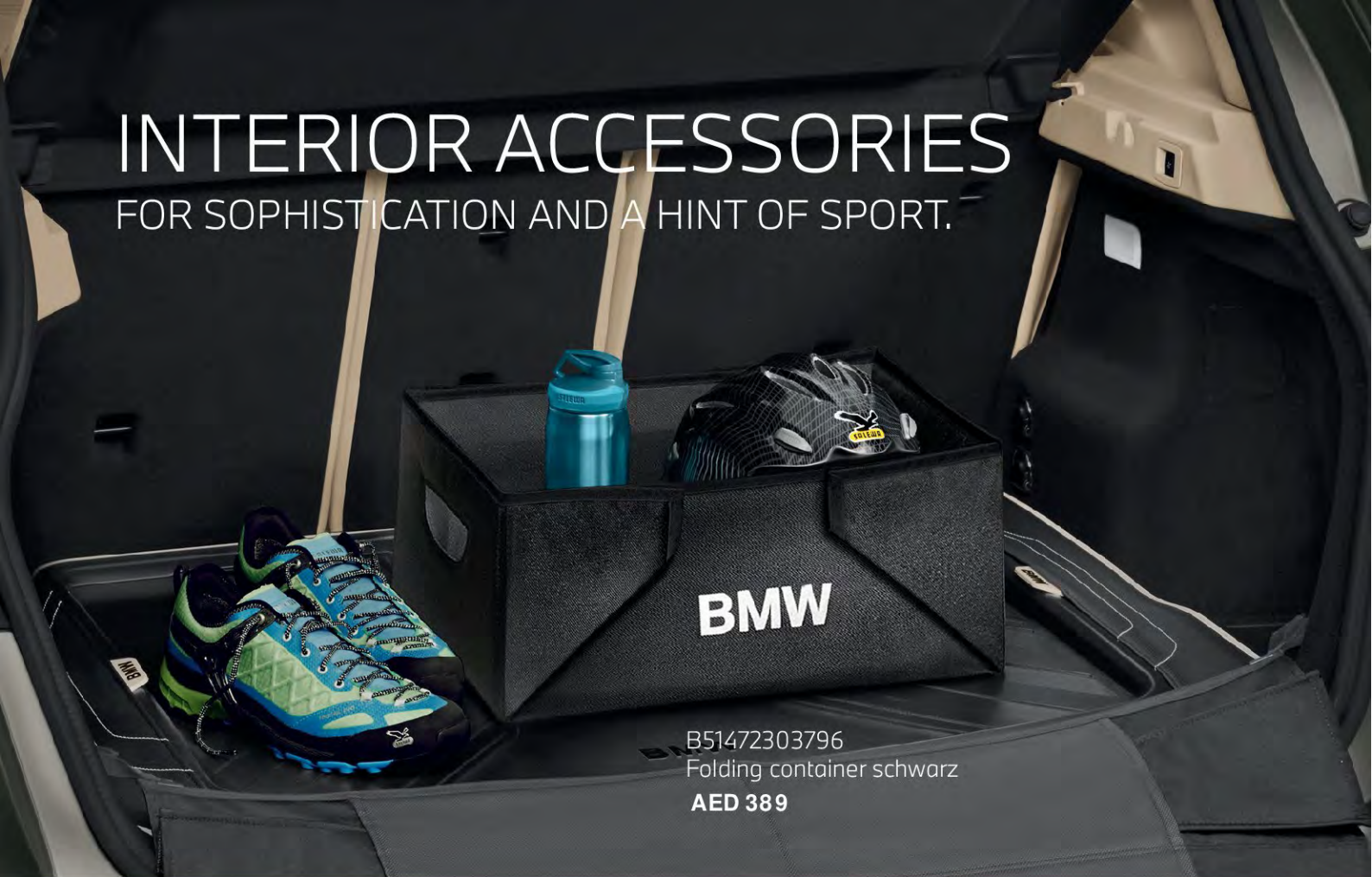
B51472303796 Folding container schwarz AED 389