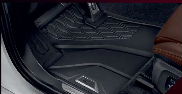
B51472458551 Floor mats. all-weather. front LHD AED 684