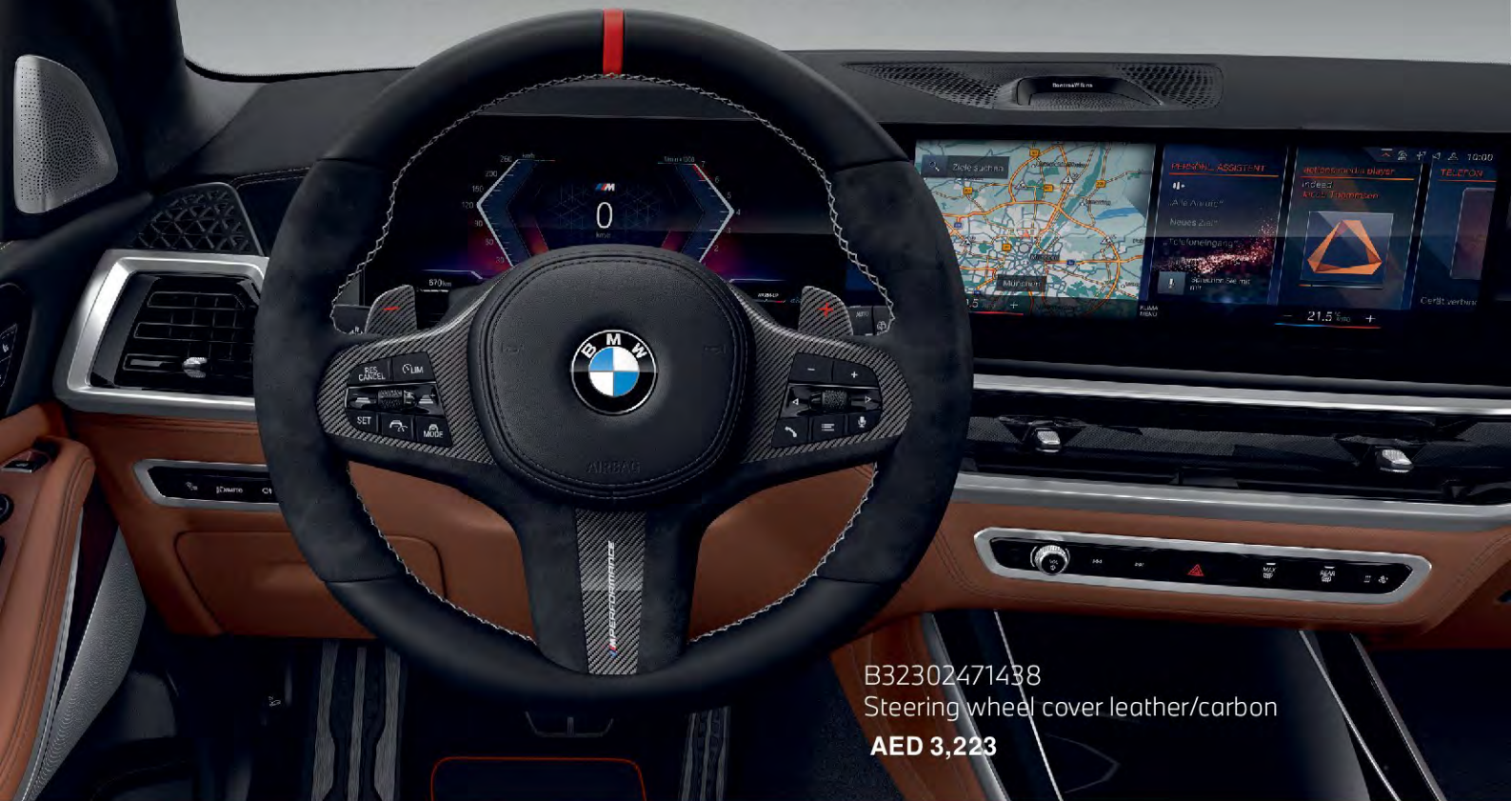
B32302471438 Steering wheel cover leather/carbon AED 3,223