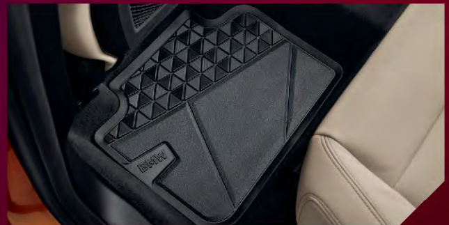
B51475A87FF2 Kit all-weather floor mats rear AED 607