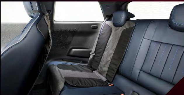
B82122448367 Backrest cover and child restraint base AED 596