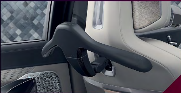
B51952449251 Clothes hanger. black T&C System AED 586