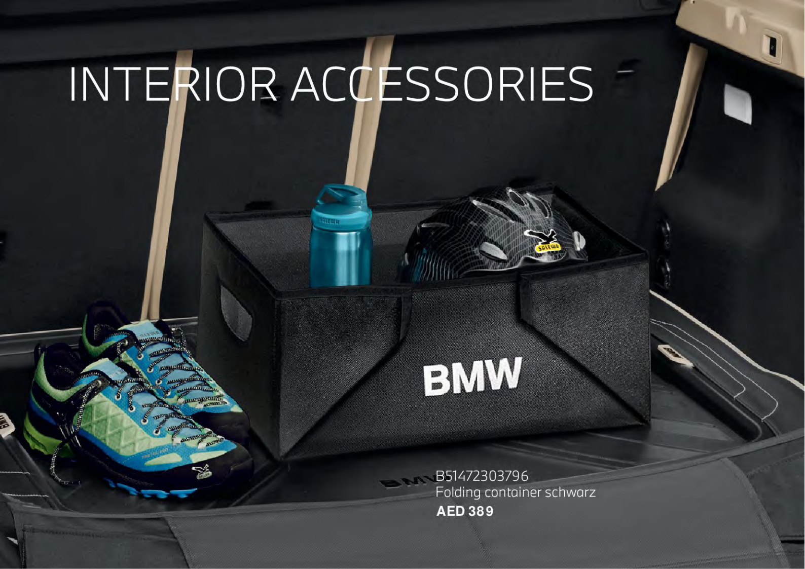
B51472303796 Folding container schwarz AED 389