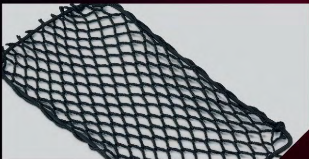
B51479410838 Boot/trunk floor net gross AED 478