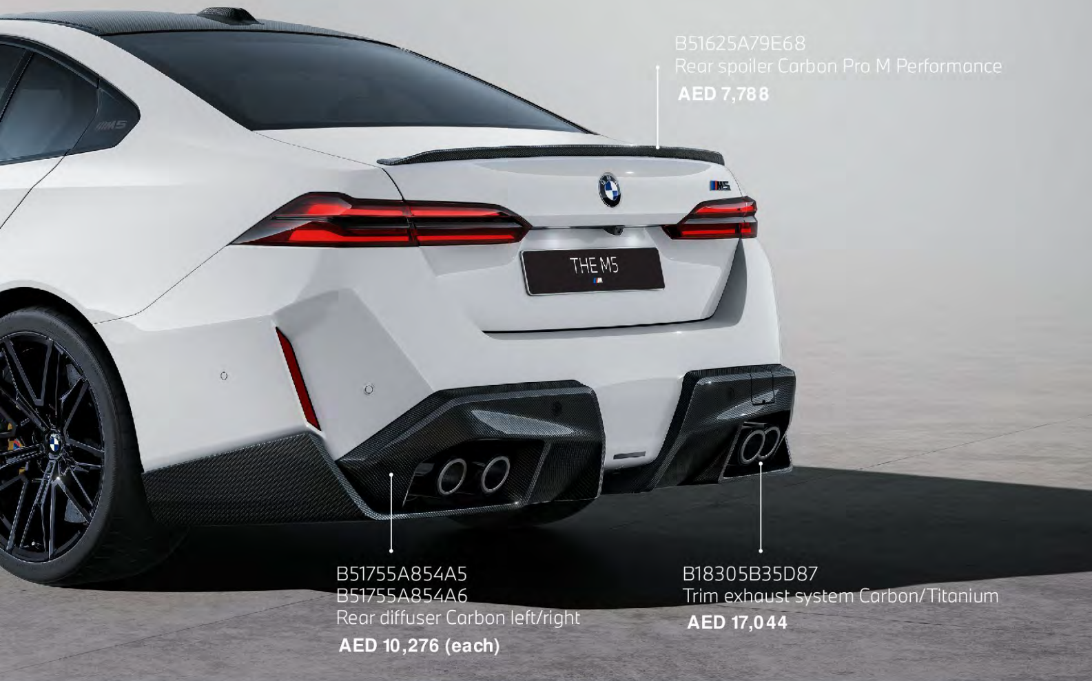
B51625A79E68 Rear spoiler Carbon Pro M Performance AED 7,788