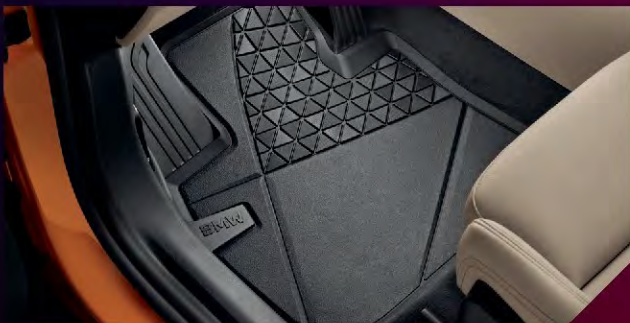
B51475A87FF0 Kit all-weather floor mats front LHD AED 718