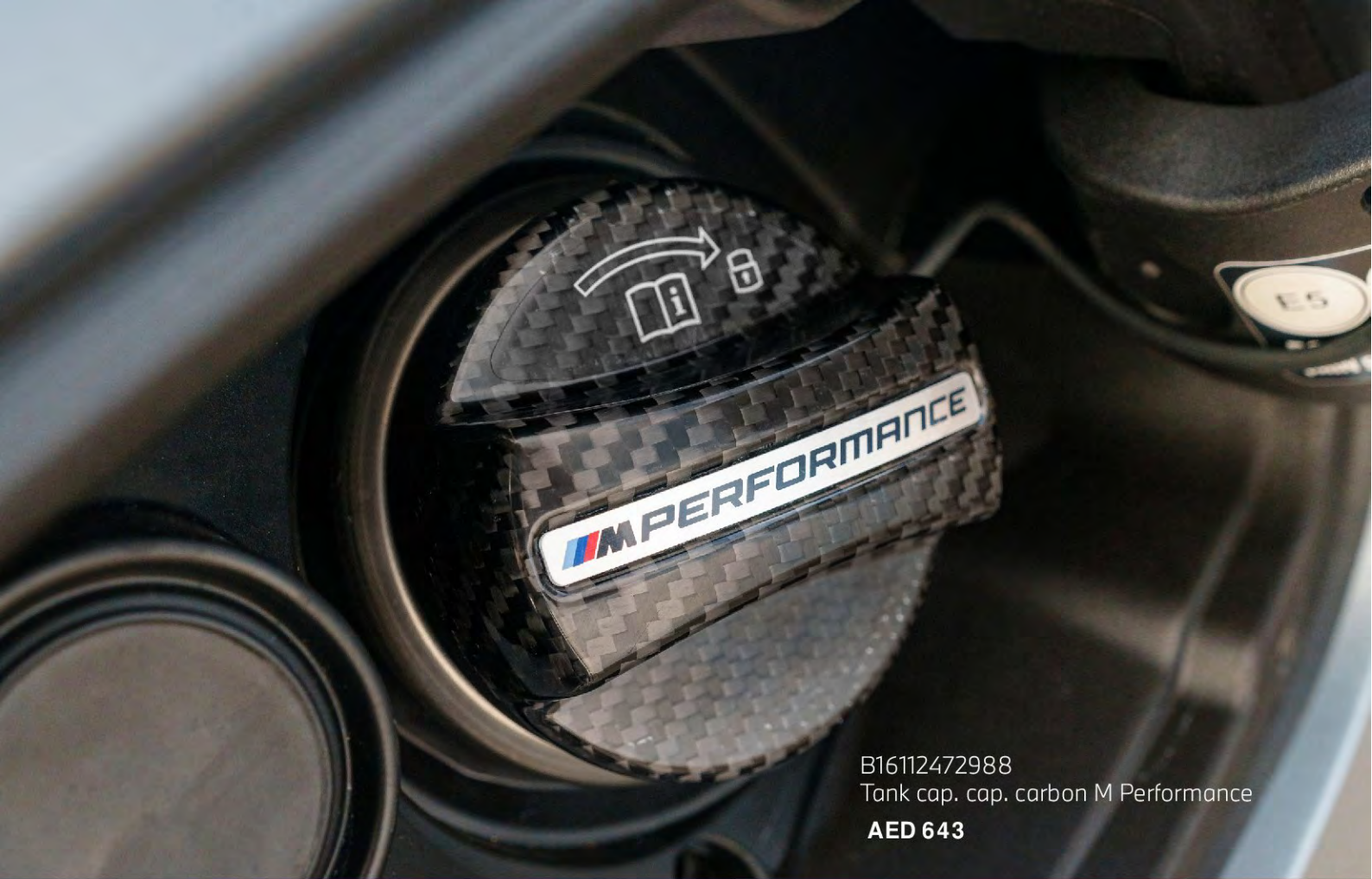
B16112472988 Tank cap. cap. carbon M Performance AED 643