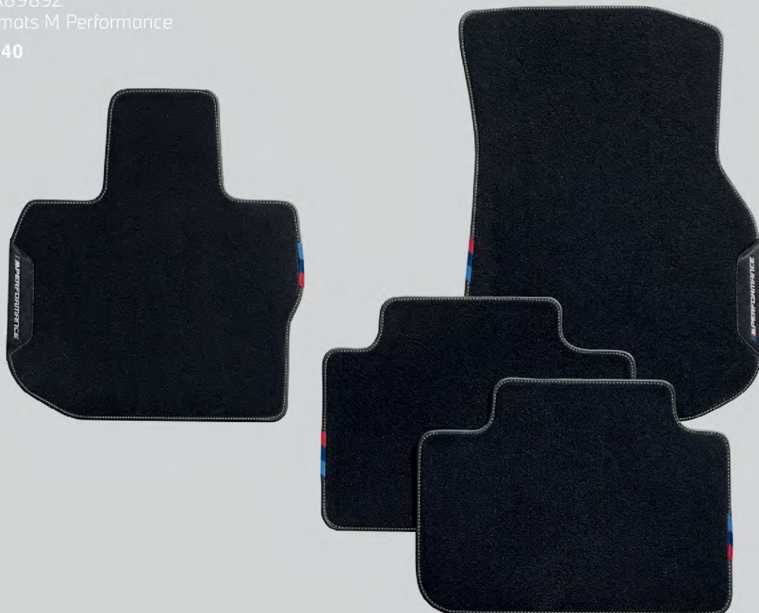
B51475A89892 Kit floor mats M Performance AED 1,940