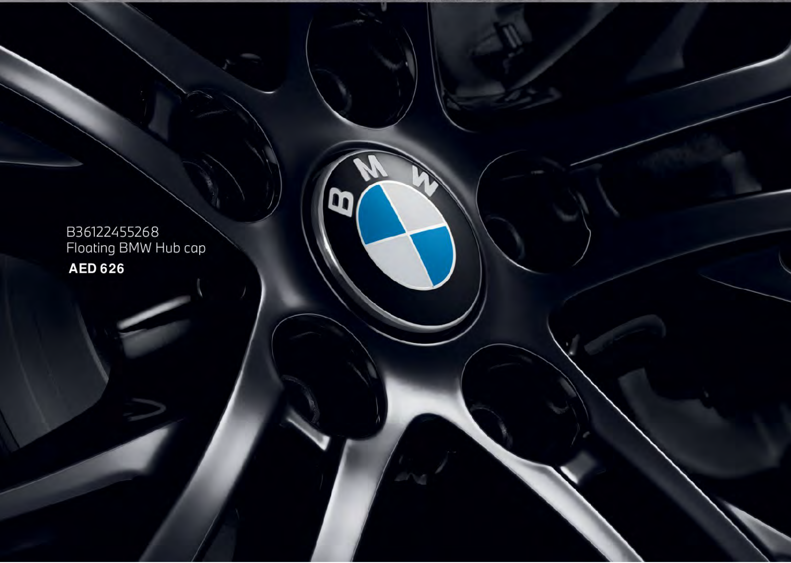
B36122455268 Floating BMW Hub cap AED 626