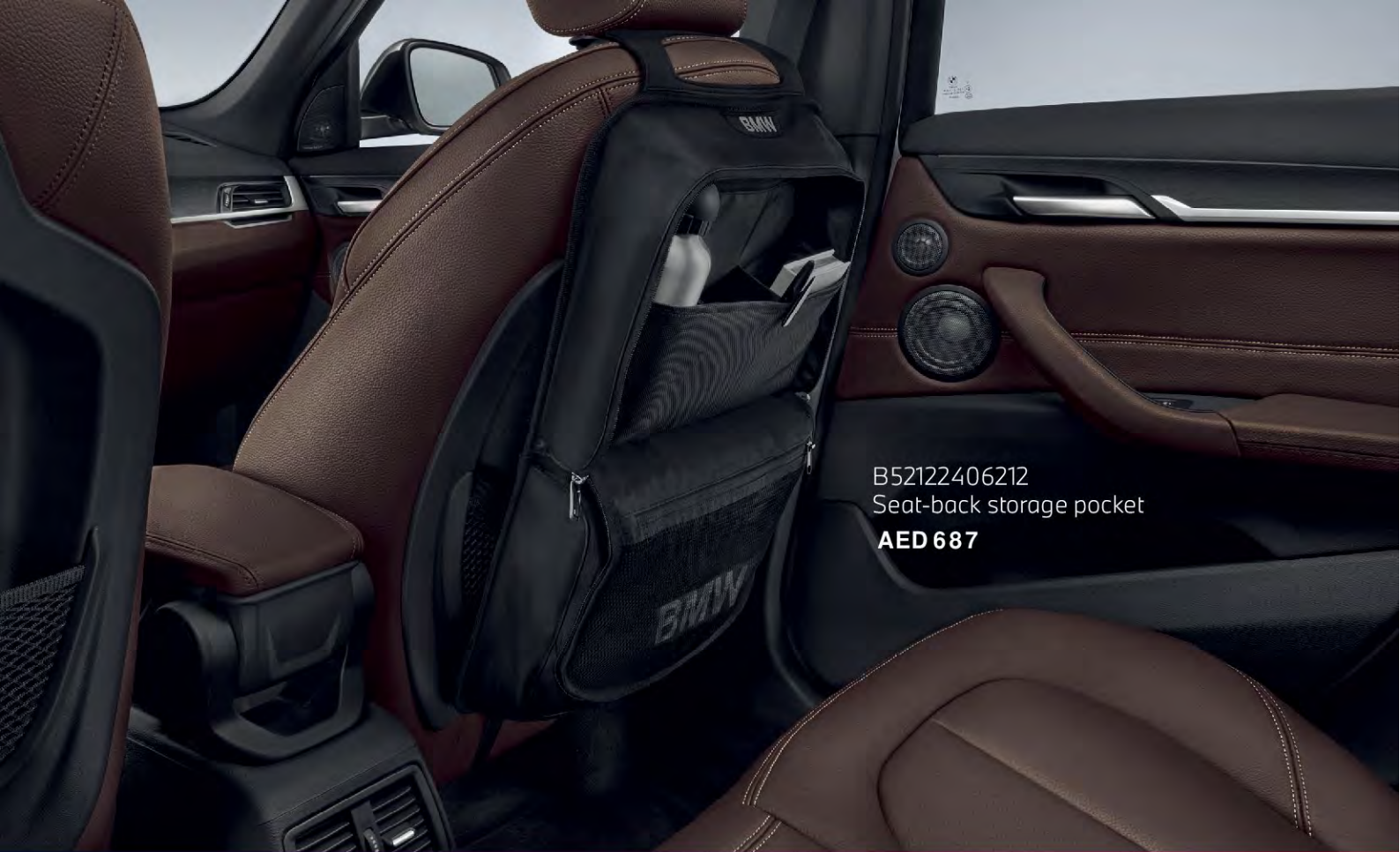
B52122406212 Seat-back storage pocket AED 687